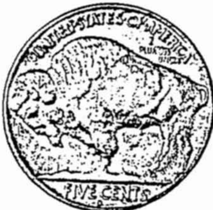
and two major errors the three-legged buffalo and the 1918 over 17 overdate.

In 1937 the Denver Mint produced some nickels where the buffalo had only 3 legs. The last variety came out in 1938 when some nickels had a "D" over "S" mint mark.