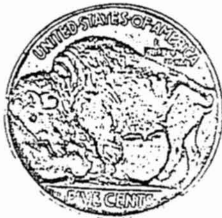
There are two varieties of the 1913 coin, one showing the buffalo on a hill and the succeeding version on flat ground;